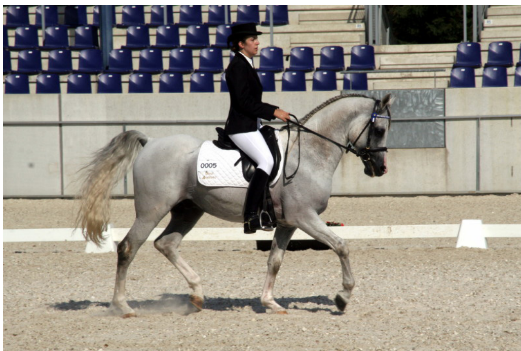
Aurilla Gold 1991 (Elegant Gold x Silver Auriol)

One of the more recent Crabbet stallions in Holland, and one still active, is the 1991 Aurilla Gold (Elegant Gold x Silver Auriol). He has successfully competed in dressage, and of his few offspring, one is an endurance horse and one has competed in tandem driving, which is unusual for an Arabian. He is owned by Quest Arabians, where he has bred foals from several Crabbet mares: CAS Sholanda (Shogun x Sharlanda), Zahlina (Masjadi Golden Shadow x Silver Zingara), and the late Naomi Rose (Taqaah x Anna Rose), a full sister to Kasadi.