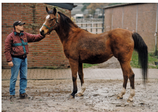
Minouche 1972 (Ismael x Hamu)

Minouche (Ismael x Hamu), a 1972 mare bred in Holland of entirely Old English lines, also produced several foals by Plakat. Her line and that of Chantal through Khouros come together in the 1986 mare Khouri BB, ex Moncya (Plakat x Minouche). She was sold to Austria and was a major producer of show winners in the 1990s. Through her daughter Kashmir, by Mirok Monpelou (Vatican x Gamila De Monpelou), she is the grand-dam of the 1997 stallion Baikal, by the Russian stallion Balaton (Menes x Panagia). He is the single most successful pure-bred western competitor in Europe at the present time. Baikal, who has competed against Quarter Horses, was the 2013 WAHO Trophy winner in Austria.