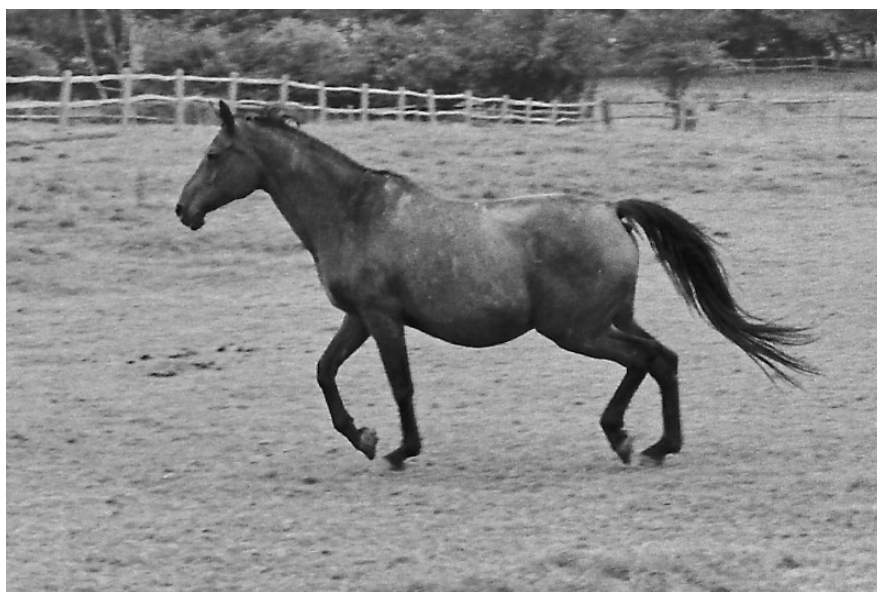
Hadassa 1959 (Rythal x Bashida)