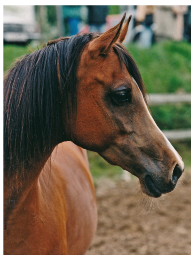
Khouri BB 1986 (Khouros x Moncya)