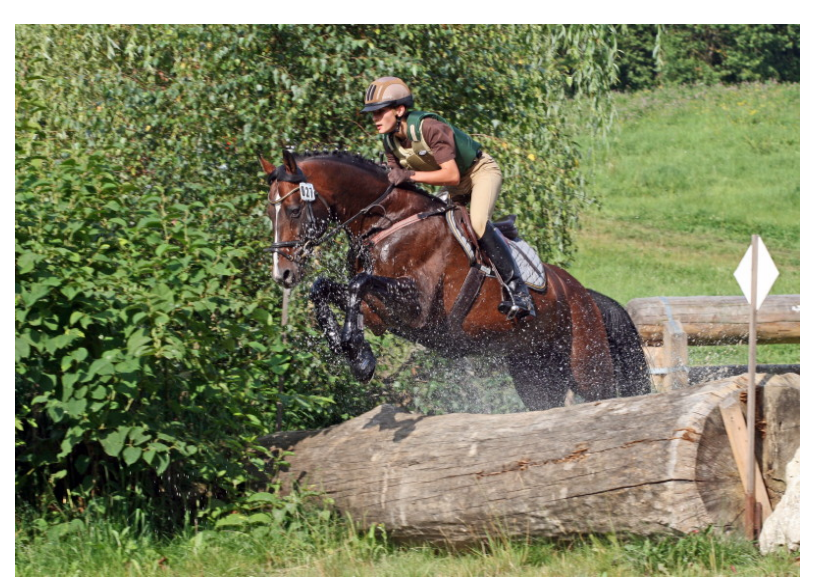
Marek Ch. 1995 (Le Tigre x Mona)

The result was the Anglo-Arab stallion Marek, an Elite stallion of the German AHS and the single most successful living Anglo-Arab stallion in Germany, both in sports and as a sire. He has competed successfully in show jumping and especially excels in cross-country and eventing, and he is the sire of two licensed Anglo stallions and several premium mares.