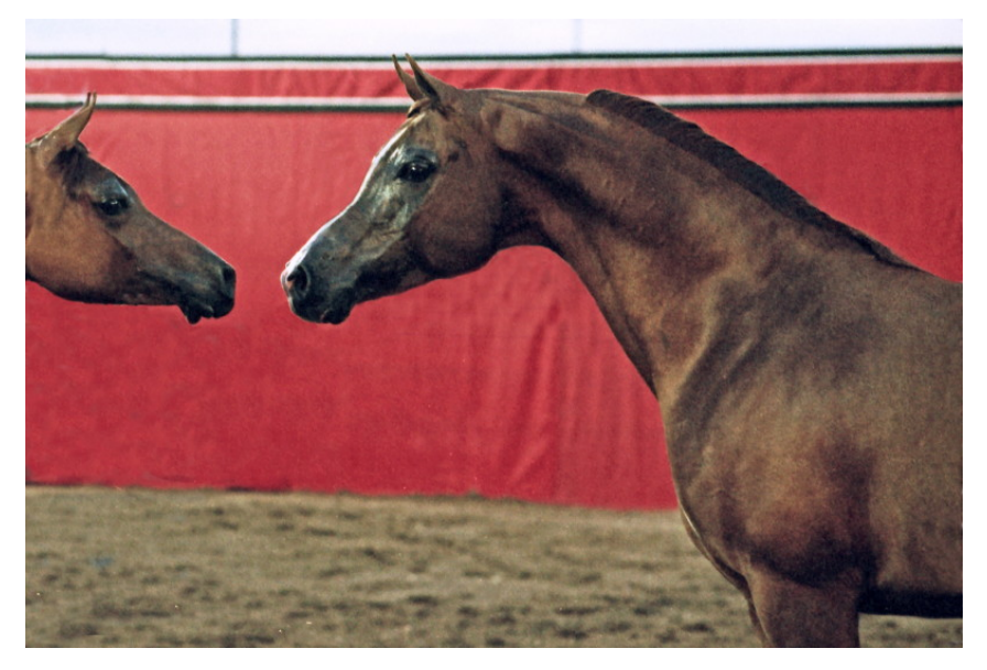
Padrons Psyche Ch. 1988 (Padron x Kilika)