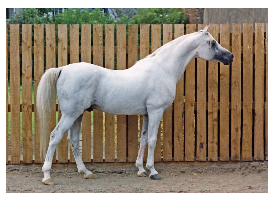
Ghibli Gr. 1966 (Ludo x Yasmina)

Of the stallions, Ghibli sired at least seven daughters that have descendants today, and some of them were very successful at the shows in their time.